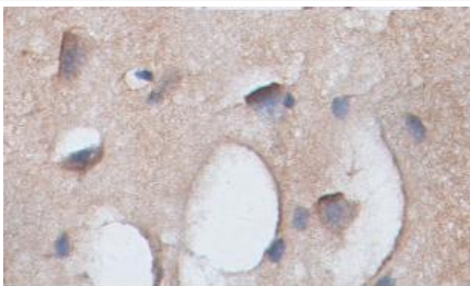
Immunohistochemical staining of formalin-fixed paraffin-embedded brain showing cytoplasmic staining with anti-ACOT7 antibody at a dilution of 1/100.