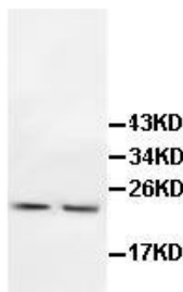
Western Blot analysis of fetal heart and muscle Lysate with anti-TNNI1 antibody