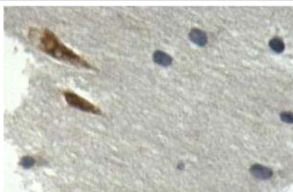
Immunohistochemical staining of formalin-fixed paraffin-embedded fetal brain staining with anti-AKR7L antibody at a dilution of 1/100.