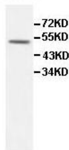
Western Blot analysis of fetal brain Lysate with anti-IL34 antibody