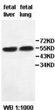
Western Blot analysis of fetal liver and lung Lysate with anti-IFIT2 antibody