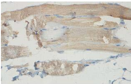
Immunohistochemical staining of formalin-fixed paraffin-embedded fetal skeletal muscle showing cytoplasmic staining with anti-AMPD3 antibody at a dilution of 1/100.