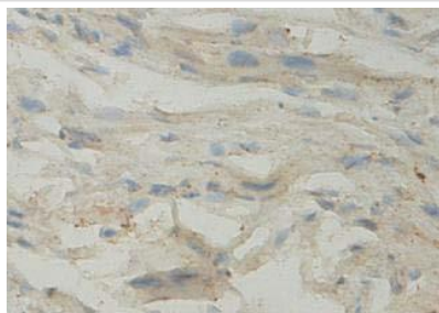
Immunohistochemical staining of formalin-fixed paraffin-embedded fetal heart showing cytoplasmic staining with anti-ISYNA1 antibody at a dilution of 1/100.