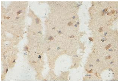
Immunohistochemical staining of formalin-fixed paraffin-embedded fetal brain showing nucleus staining with anti-ZNF300 antibody at a dilution of 1/100.