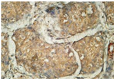
Immunohistochemical staining of formalin-fixed paraffin-embedded fetal testis staining with anti-PIH1D2 antibody at a dilution of 1/100.