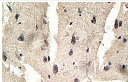
Immunohistochemical staining of formalin-fixed paraffin-embedded fetal brain staining with anti-ANKRD50 antibody at a dilution of 1/100.