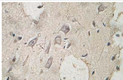
Immunohistochemical staining of formalin-fixed paraffin-embedded fetal brain showing cytoplasmic staining with anti-PITPNC1 antibody at a dilution of 1/100.