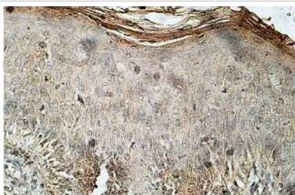
Immunohistochemical staining of formalin-fixed paraffin-embedded fetal skin showing membrane staining with anti-RAB4A antibody at a dilution of 1/100.