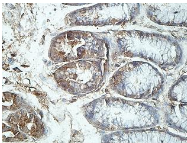
Immunohistochemical staining of formalin-fixed paraffin-embedded human stomach showing cytoplasmic staining with anti-VTA1 antibody at a dilution of 1/100