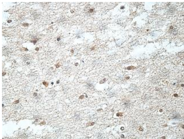
Immunohistochemical staining of formalin-fixed paraffin-embedded fetal brain showing membrane staining with anti-FICD antibody at a dilution of 1/100