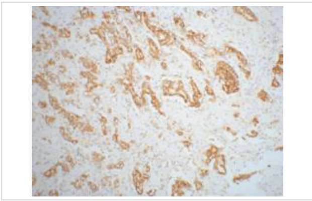
IHC staining of mouse prostate adenocarcinoma tissue, diluted at 1:200.

Note: This product is for in vitro research use only