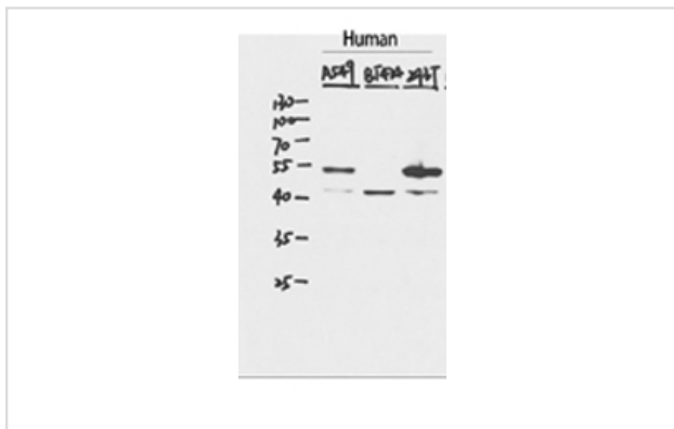
Western Blot analysis of A549 293T cells using p53 Polyclonal Antibody

Note: This product is for in vitro research use only