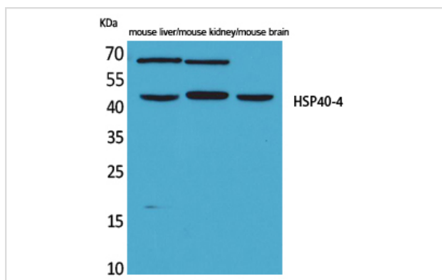
Western Blot analysis of mouse liver mouse kidney mouse brain cells using HSP40-4 Polyclonal Antibody