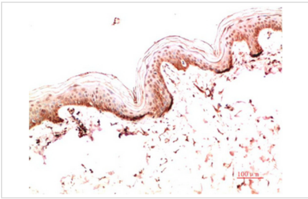
Immunohistochemical analysis of paraffin-embedded Human Skin Tissue using Collagen I Mouse mAb diluted at 1:200.

Note: This product is for in vitro research use only