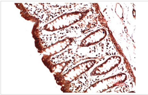
Immunohistochemical analysis of paraffin-embedded Human Colon Carcinoma Tissue using Collagen II Mouse mAb diluted at 1:200