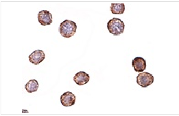
Immunohistochemistry of CXCR4Lo in HeLa cells with CXCR4Lo antibody at 2 ug/mL.