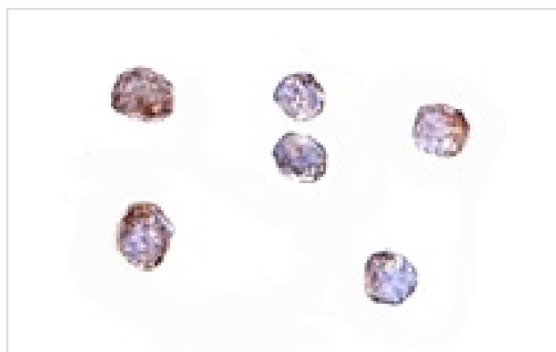
Immunocytochemistry of CLDN1 in HepG2 cells with CLDN1 antibody at 5 ug/mL.