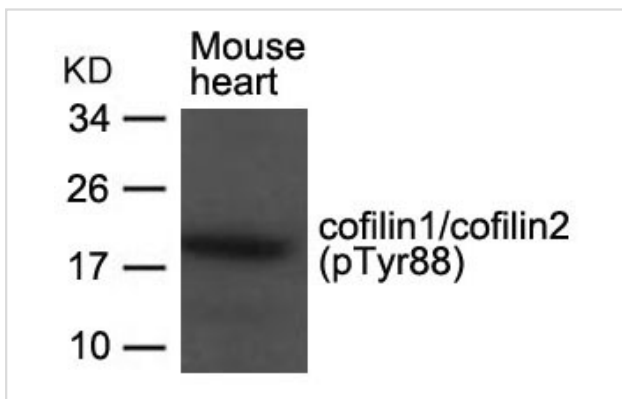
Western blot analysis of extracts from Mouse heart tissue using cofilin1/cofilin2(phospho-Tyr88) Antibody #11507.