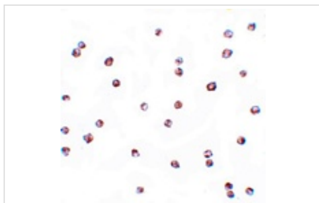
Immunocytochemistry of FOXO3 in A-20 cells with FOXO3 antibody at 4 ug/mL.