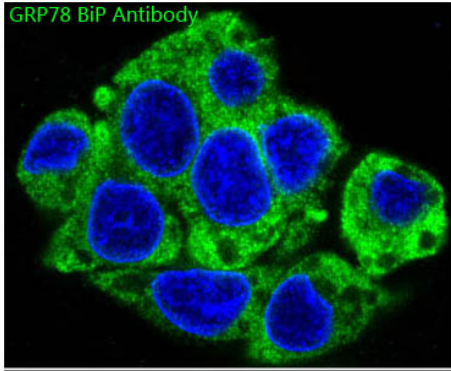
Immunofluorescent analysis of HepG2 cells, using GRP78 BiP Antibody .