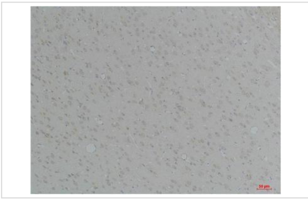
Immunohistochemical analysis of paraffin-embedded Rat BrainTissue using KCNN4(SK4) Rabbit pAb diluted at 1:200.

Note: This product is for in vitro research use only