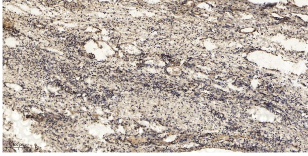
Immunohistochemical analysis of paraffin-embedded human oophoroma.

Note: This product is for in vitro research use only