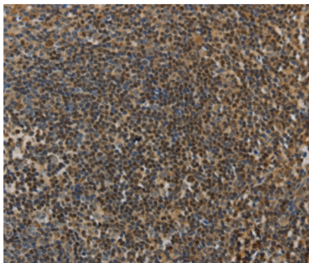
Immunohistochemical analysis of paraffin-embedded Human thyroid cancer tissue using #35801 at dilution 1/20.